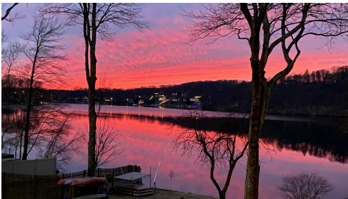
Sunset over the lake taken in Melissa S's backyard near the Clubhouse